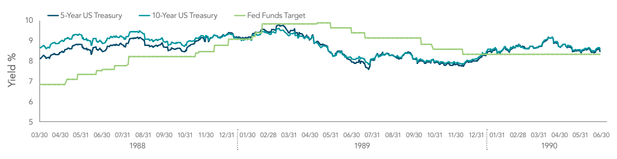
Exhibit 2: Late 1980s Inverted Yield Curve

Past performance is no guarantee of future results.