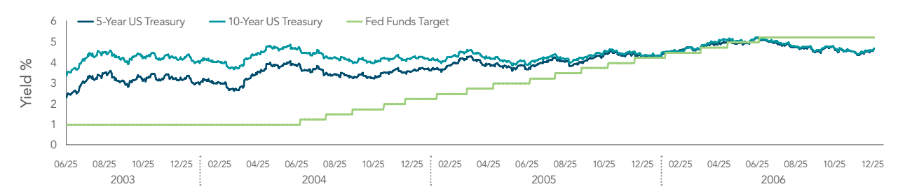
Exhibit 1: Fed Funds Rate and Treasury Yields

Past performance is no guarantee of future results.